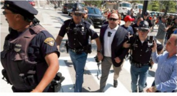
Facebook removes Alex Jones pages for hate, bullying