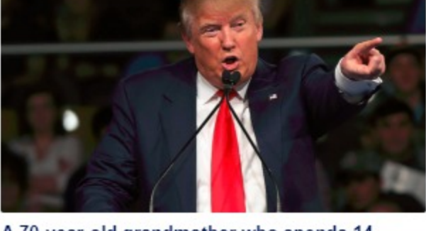
A 70-year-old grandmother who spends 14 hours a day tweeting hundreds of messages in support of Donald Trump was reportedly flagged as a bot