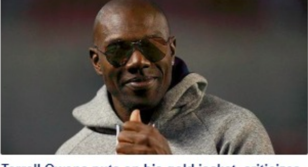
Terrell Owens puts on his gold jacket, criticizes Hall of Fame voters