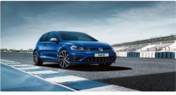
The Volkswagen Golf R.