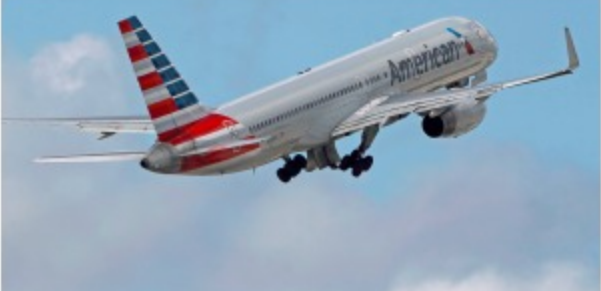
American Airlines kicked a woman off a flight after she brought her $30,000 cello onboard even though she bought a seat for it (AAL)