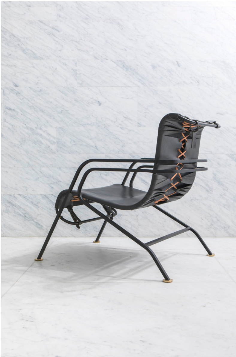
Sahar Bizri Designs

Another piece of theirs with its curvy steel lines and voluptuous leather feel, is the “Chaise Corset”, which is an invitation to sensuality. It is a provocative piece which depicts the architects’ passion for raw materials and structural precision, natural ergonomics and masterful handcraftsmanship.