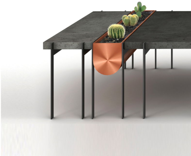
Mawsam by Ziad Abi Karam

Discover how George Geara translates feelings to music in Nuance. What's Nuance we ask George... It is a series of modules made of different materials and functions, when put together creates a unique multipurpose table... "Music and design are inherently interrelated, they both are forms of calculated expression. As a musician, naturally driven by the rhythm, I concertized my conception into sequenced modularities; once connected they create a set of customized, multifunctional object ... the Nuance. This table challenges proportions, peak the curiosity and add personality to any space.