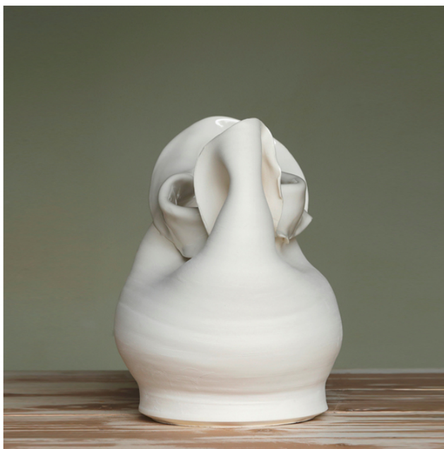
Unveiling