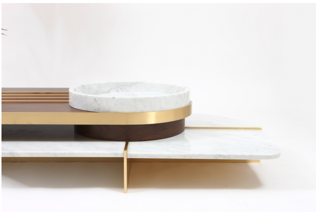
Revolve Coffee Table