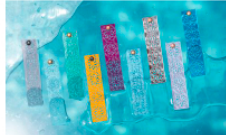
MAAT | Plexi Dripping