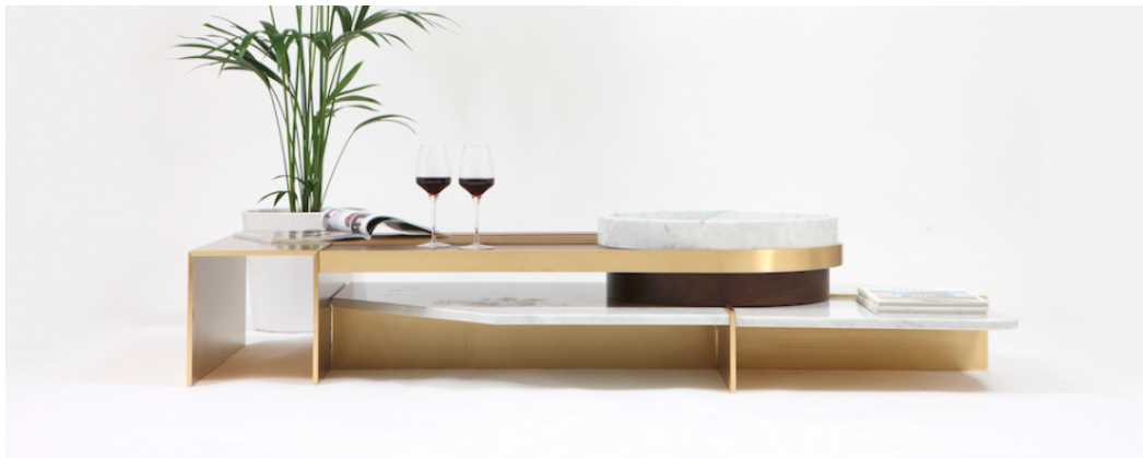
Revolve Coffee Table