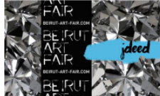
What to expect at Beirut Art Fair 2018