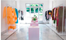
FAUX | Lebanon's first multi-brand PR showroom space