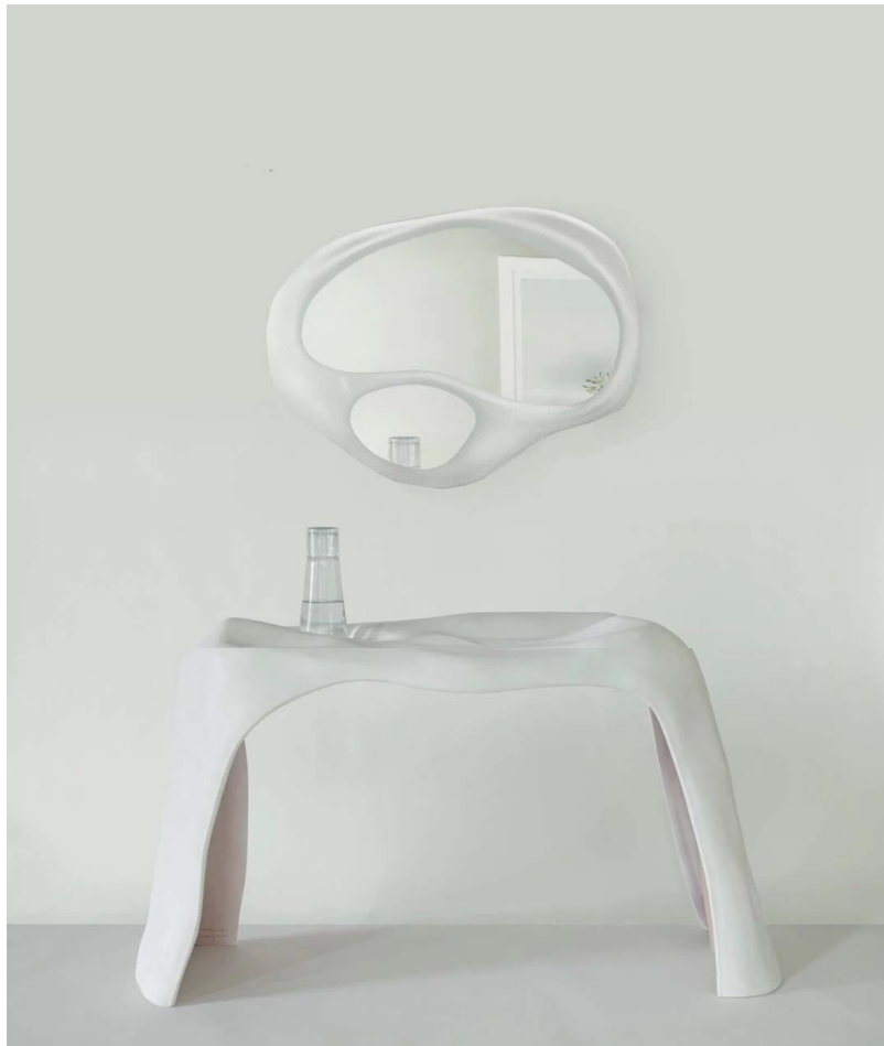
Anatomy, Roula Salamoun x House of Today. Landscape

Roula Salamoun's collaboration with House of Today has seen the Lebanese architect and designer produce limited-edition pieces for a collection titled Anatomy , exploring the relationship between human bodies and the space they occupy. Appearing as anthropomorphic landscapes in interior living spaces, her console and mirror originate from casts created from different body parts and give new meaning to high-performance concrete.