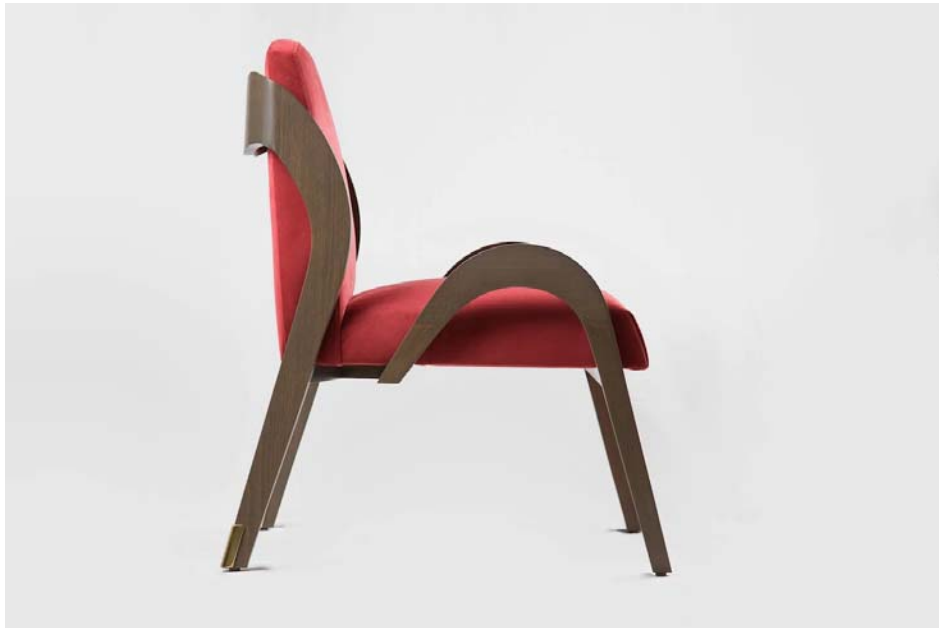
Lama Salloum, armchair from To and Fro collection

Lama Salloum , founder of Lebanese interior design studio Offgrid, will debut two pieces - a side table and armchair - from her To and Fro collection. Inspired by human motions and emotions, they display abstract shapes and a diversity of materiality, with marble, wood and brass crafted into shape by local artisans.