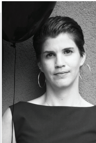
Co-founder & Head of Exhibitor Relations

In addition, it's important to take into account the Lebanese diaspora, a vast network of 14 million people throughout the world. They also play an essential role in making Lebanon a remarkable design platform – a reality that has attracted the attention of collectors.